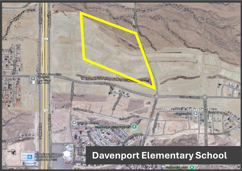
Davenport Elementary School

New state-of-the-art 21 st Century Learning Facility to include: Cafeteria, Library, Gymnasium, Admin, Collaboration Spaces, Special Education, New Playfields, New Parking, Bus Loop