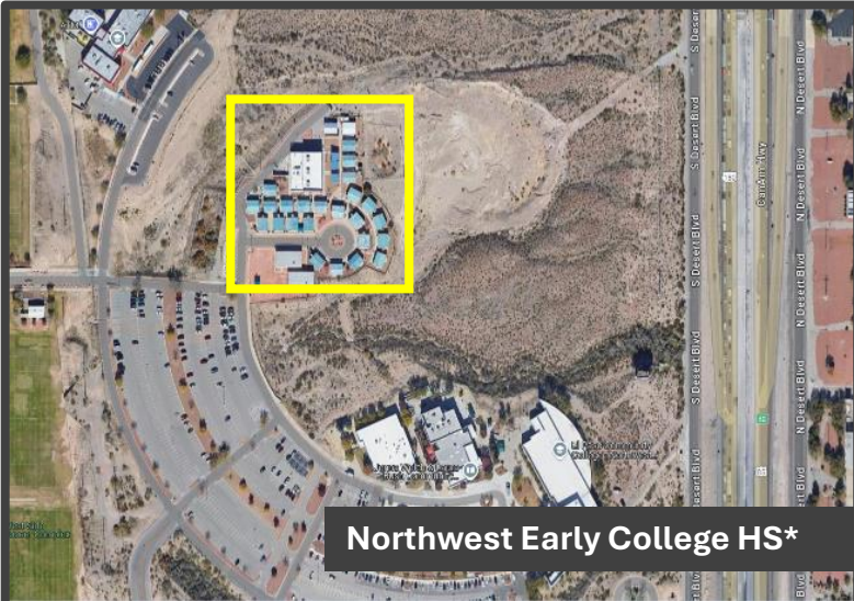
Northwest Early College HS*