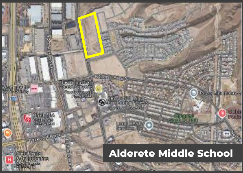
Alderete Middle School

New state-of-the-art 21 st Century Learning Facility to include: Cafeteria, Library, Gymnasium, Admin, Collaboration Spaces, Special Education, New Playfields, New Parking, Bus Loop