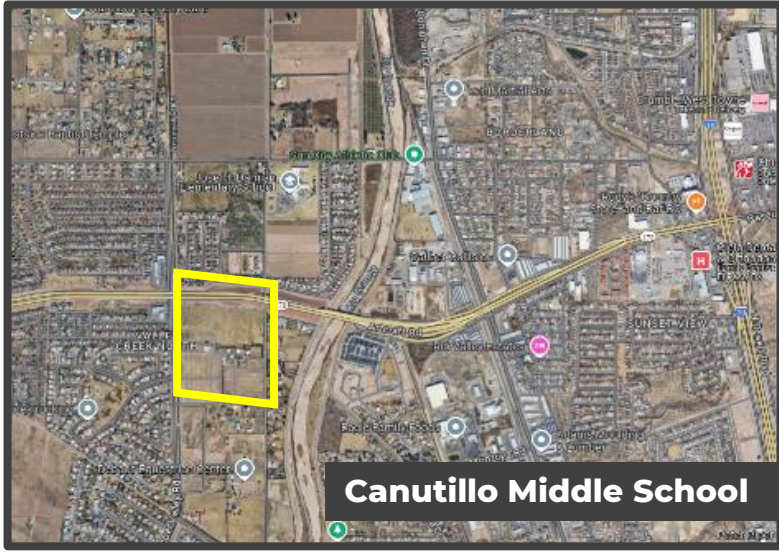
Canutillo Middle School